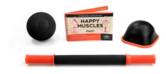
Tiger Tail Myofascial Release Tools ($127.96 retail value)