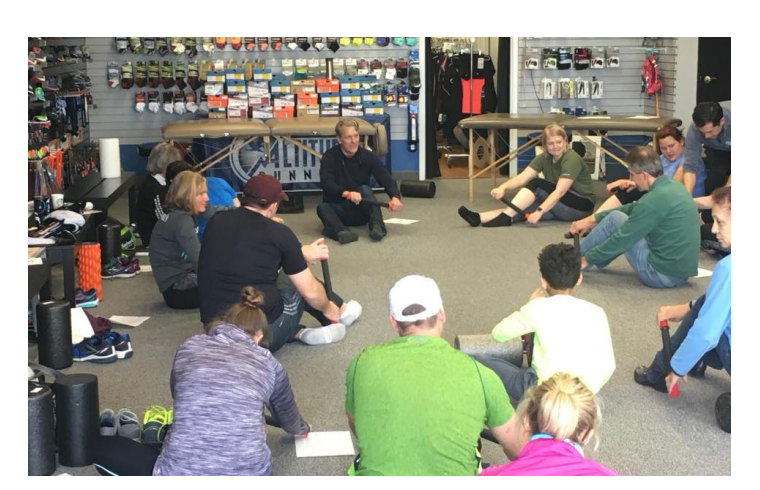
Tiger Tail Roll-Out Session