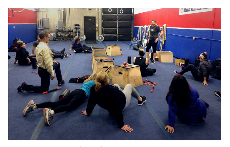
Tiger Tail Muscle Recovery Boot Camp

Founded in 2006, Tiger Tail USA pioneered making muscle recovery mainstream in the USA and around the world. Tiger Tail USA was the first to successfully create and market the hand-held foam roller, which is now a part of nearly every top-level training room across the country. Trusted by million-dollar muscles, our tools are recommended and used by doctors, chiropractors, physical therapists, athletic trainers, professional athletes, and people just like you — worldwide. Researched and developed by Tiger Tail USA, the Tiger Tail® Active Recovery program is gaining in popularity and is already being offered as part of employee corporate wellness programs.